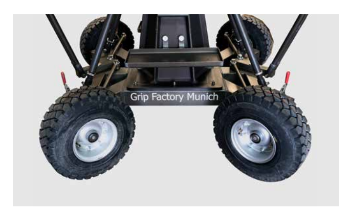
GF-16000 GF-16 Base Dolly with double ended steering