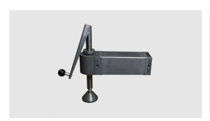
GF-16310 Levelling leg set for GF-16 [4 pcs.]