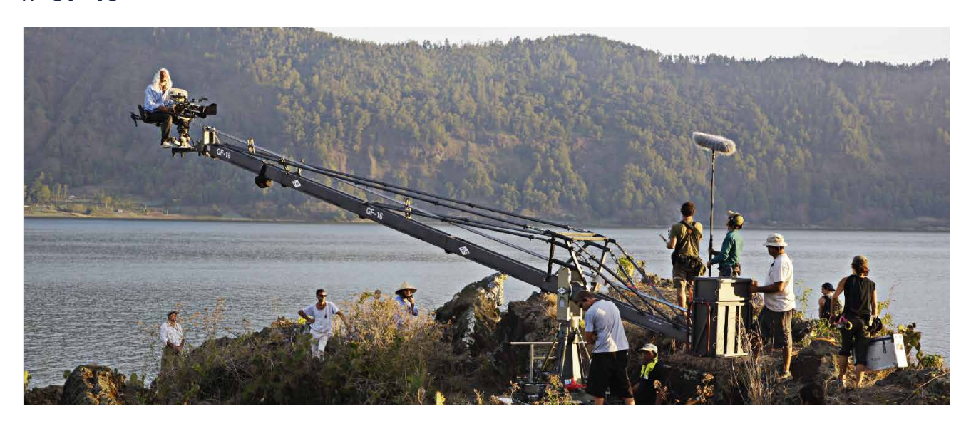
The GF-16 Crane System is the ultimate in »big« modular, rideable and remote cranes. It satisfies the demands of the crane operator when it comes to safety, transport, ease of assembly and inshot stability as well as giving the DOP an amazing range of choice to create that dream shot.