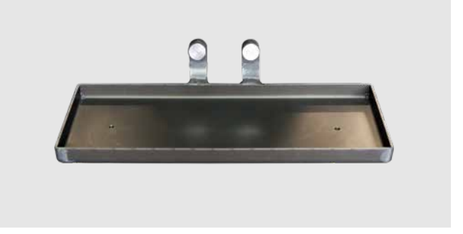
GF-16330 Utensil shelf for Mounting Column