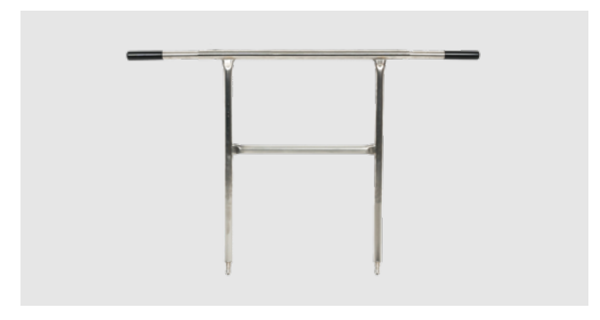
GF-16001 Base Dolly push bar