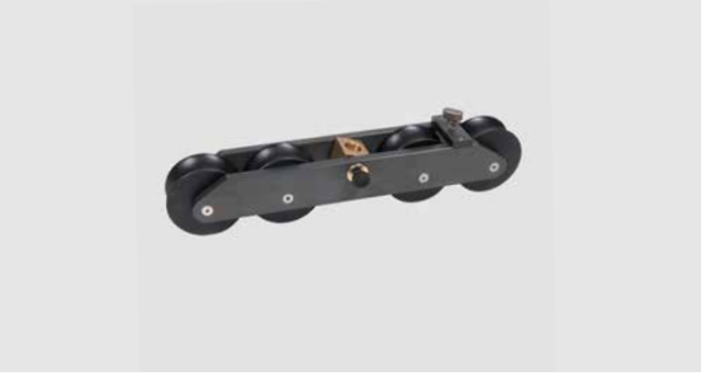
GF-16320 Track wheel set plastic [4 pcs.]