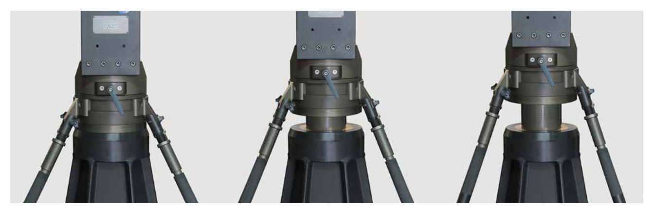
Height adjustable mounting column