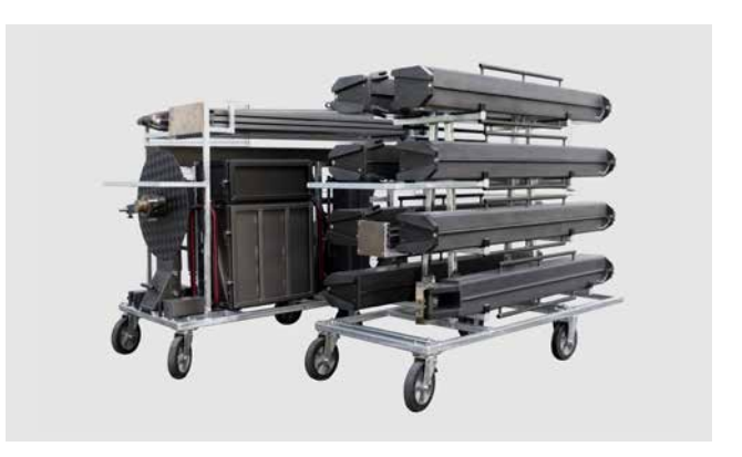
GF-16199 Set of transport trolleys for GF-16 Crane (2 units)